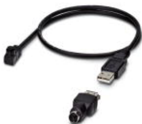
Adapter set with 0.5 m cable, to supply the PSI Bluetooth RS-232 adapter from a USB or PS2 interface

Please be informed that the data shown in this PDF Document is generated from our Online Catalog. Please find the complete data in the user's documentation. Our General Terms of Use for Downloads are valid ( http://phoenixcontact.com/download )