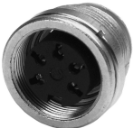
View represents all available contact positions.

Series Circular Connectors C091 Subseries Circular Connector C 091 A