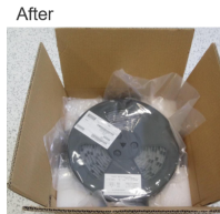
300pcs per Carton ( 2x reel)

Before 400pcs per Carton ( 2x 200pcs/reel)