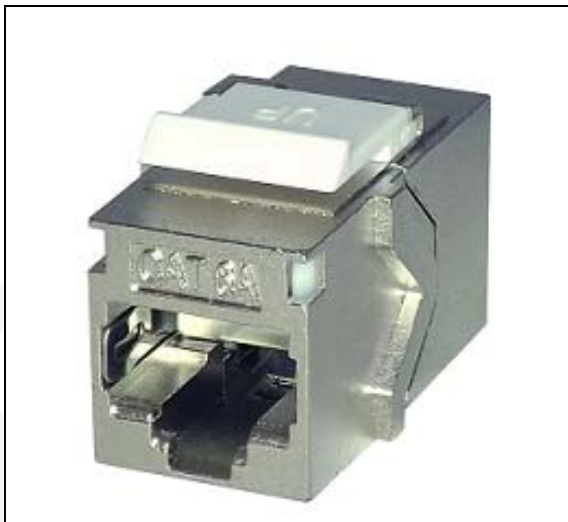
Category 6A Shielded Keystone Panel Mount Coupler (SGACK2S, SGACK2S-24)